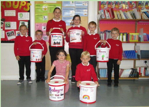
Some of our Bag Packers with their buckets

The Beat The Bog campaign is going well. The parent council held a very successful bag pack at Tesco in Montrose on the 3 rd June which raised £880.48. I would like to reiterate how grateful we are to all parents, children and staff who gave up some (or all) of their Saturday to come and help.